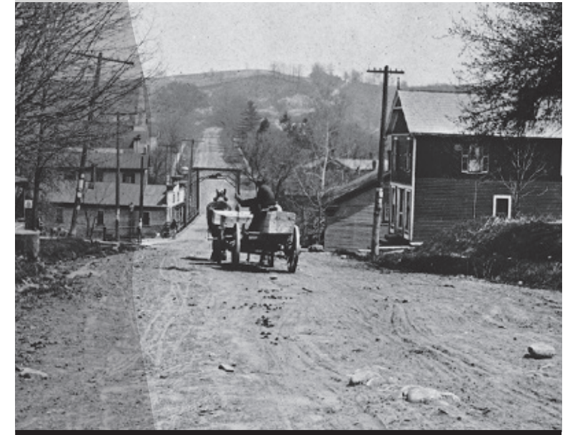
Looking east on Main Street, circa 1915.