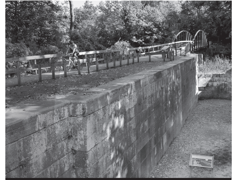
Lock 29.

SUMMIT COUNTY SECTION CUYAHOGA VALLEY NATIONAL PARK PENINSULA