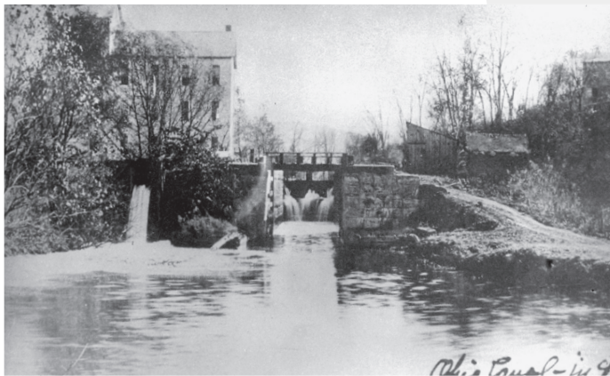
Lock 29 and gristmill, 1890s.

Or go straight back to the parking lot—you decide. At the depot, learn how you can take a scenic train ride. But if you hear your belly growling, Grab a bite in Peninsula to calm the howling.