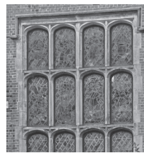
Stained glass window