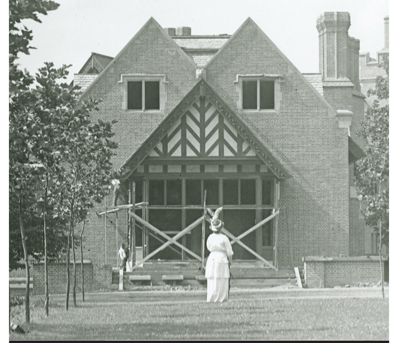
Gertrude Seiberling observes the Manor House construction, c.1915