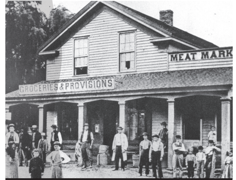
Mustill Store, circa 1866.