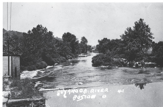
Cuyahoga River, probably pre-1913

West of the river were American Indians' homes. To the east of the river, white men roamed. Look to where the rail platform stands; Imagine an Seneca village at hand.