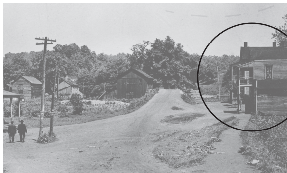
Jim Brown's hotel, far right

To finish your infamous quest, Go to the front desk, treasure box to request.