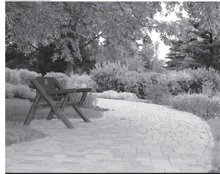
Rock & Herb Garden at F.A. Seiberling Nature Realm

SUMMIT COUNTY SECTION F.A. SEIBERLING NATURE REALM