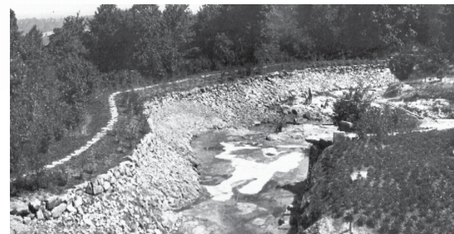
Construction of the Lagoon, c. 1914.

The stone taken from here was ground up to make glass. I filled the depressions with water, planted foliage and grass.