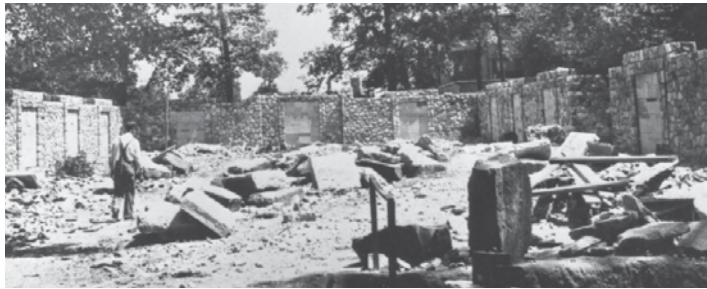
Construction of the English Garden, 1914.

Step inside this walled “secret garden.” A water goddess waits within. Explore awhile and relax on a bench, before exiting where you came in.