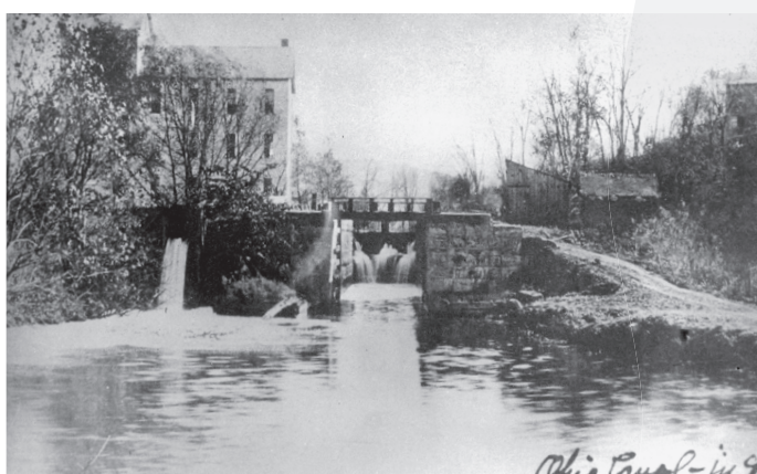
Lock 29 and gristmill, 1890s.

Or go straight back to the parking lot—you decide. At the depot, learn how you can take a scenic train ride. But if you hear your belly growling, Grab a bite in Peninsula to calm the howling.