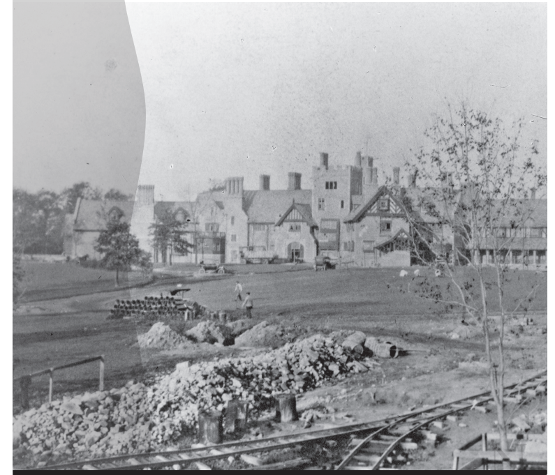
Construction of Stan Hywet , c. 1915.

SUMMIT COUNTY SECTION STAN HYWET HALL & GARDENS