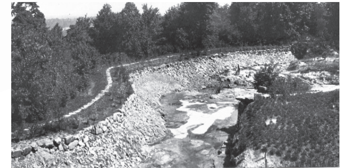
Construction of the Lagoon, c. 1914.

The stone taken from here was ground up to make glass. I filled the depressions with water, planted foliage and grass.