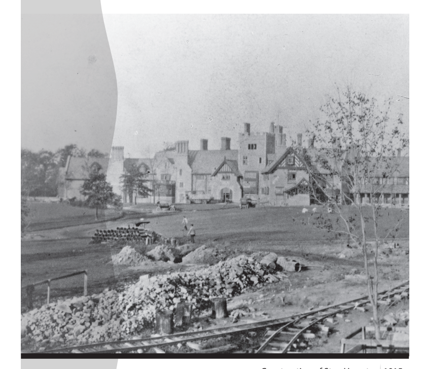
Construction of Stan Hywet, c. 1915.