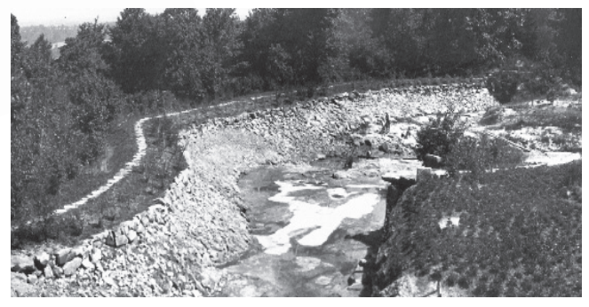
Construction of the Lagoon, c. 1914.

The stone taken from here was ground up to make glass. I filled the depressions with water, planted foliage and grass.