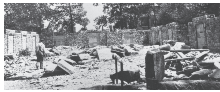
Construction of the English Garden, 1914.

Step inside this walled "secret garden." A water goddess waits within. Explore awhile and relax on a bench, before exiting where you came in.